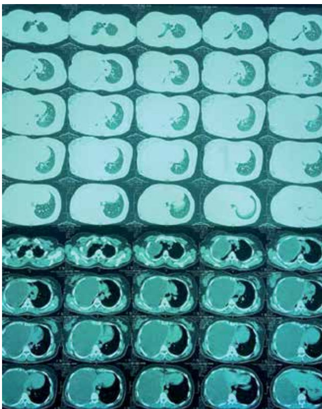
Figure 1. Huge cystic lesion with severe mediastinal shift

By performing the principles of complete evacuation, hydatid cyst drainage was done. After complete evacuation of the daughter cysts, the membrane of the pleural hydatid cyst was carefully removed from the thoracic wall, lung parenchyma, pericardium, and diaphragm. The pulmonary parenchyma was highly intact. The membrane of the cyst had communication with the sub-diaphragmatic area through a very small stem that was about 3–4 mm in length. As a result, the diaphragm was opened via the tract, and numerous liver daughter cysts that soaked in bile and solved by bile were seen. The cysts were removed as much as possible. The remarkable point was that the pleural daughter cysts were healthy and active; however, the liver daughter cysts were destroyed by bile. Then the